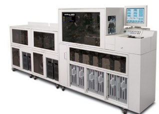
Cummins JetScan MPS 4115 shown with two strappers.