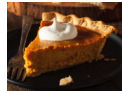
Pumpkin Pie Pre-Baked 8"