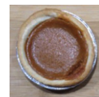
Pumpkin Pie 4" Gaudet