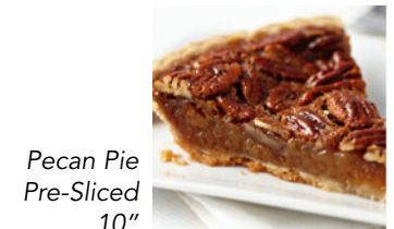
Pecan Pie Pre-Sliced 10"