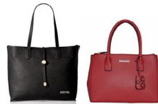
KENNETH COLE REACTION DOWLING SATCHEL