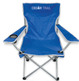
CEDAR TRAIL XL CAMPING CHAIR