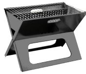
CEDAR TRAIL FOLDING GRILL